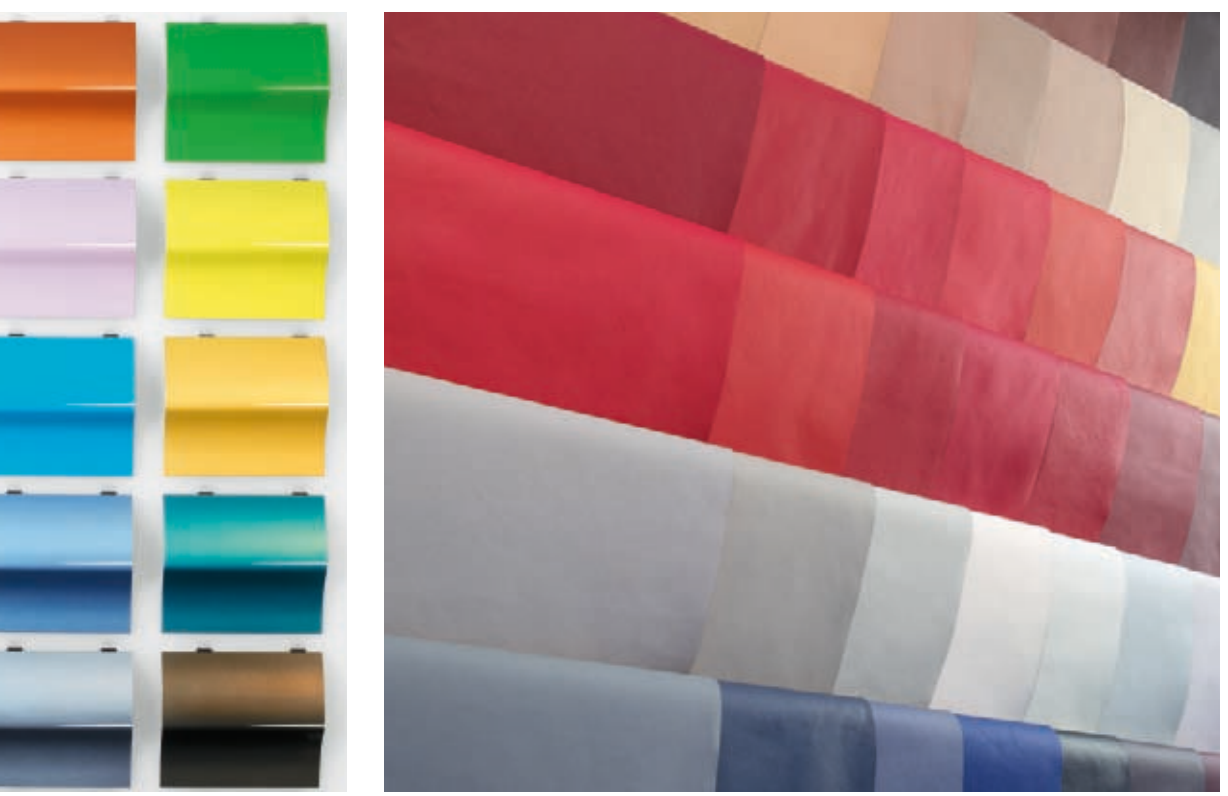
Some examples of color-to-sample paints

We offer a comprehensive selection of colors and materials for you to choose from when designing your new Porsche. A range of colors to sample is available for the interior and exterior, as well as high-quality materials such as Leather, Alcantara<sup>®</sup>, elegant Mahogany, Carbon, and Aluminum to enhance the interior. You can find out what is possible at your Authorized Porsche dealer. Alternatively, you can contact one of our Customer Consultation Specialists, who would be pleased to assist you directly to give you the exclusive advice you need.