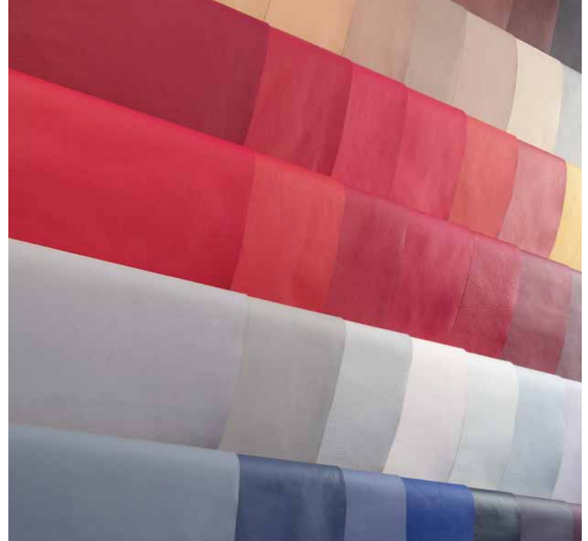
Leather in color to sample