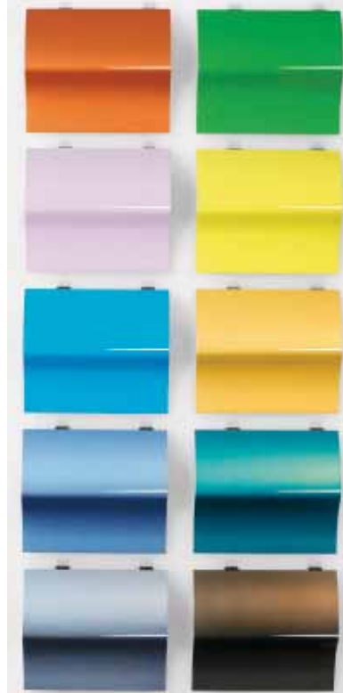
Paint in color to sample

We offer a comprehensive selection of colors and materials for you to choose from when designing your new Porsche. A range of colors to sample for the interior and exterior is available, as are high-quality materials such as Leather, Alcantara®, elegant Mahogany, Carbon, and Aluminum to enhance the interior. You can find out what is possible at your Authorized Porsche dealer. Alternatively, an appointment with our specialists who can provide you with private Exclusive design advice to create your distinctive Boxster.