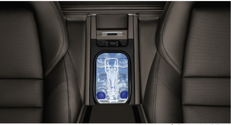
Cooling compartment in the rear