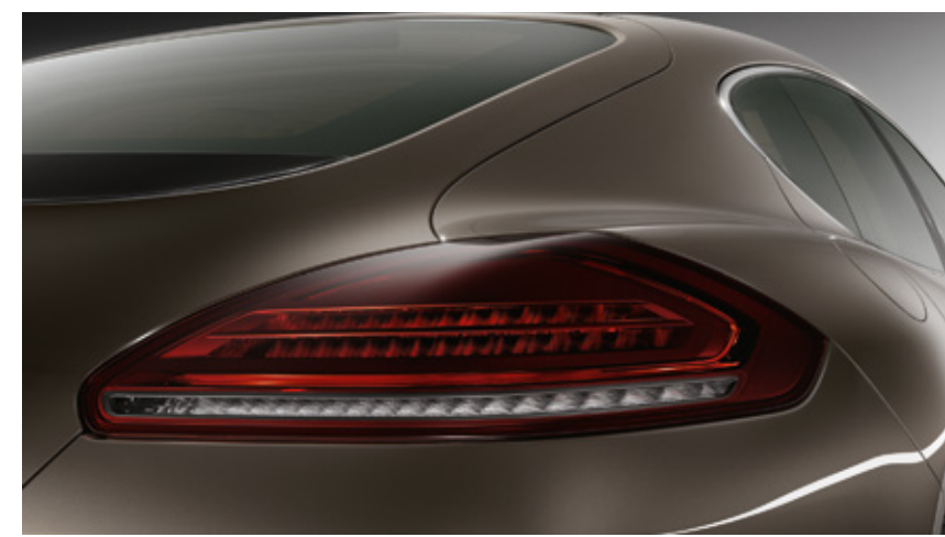
Tinted LED taillights