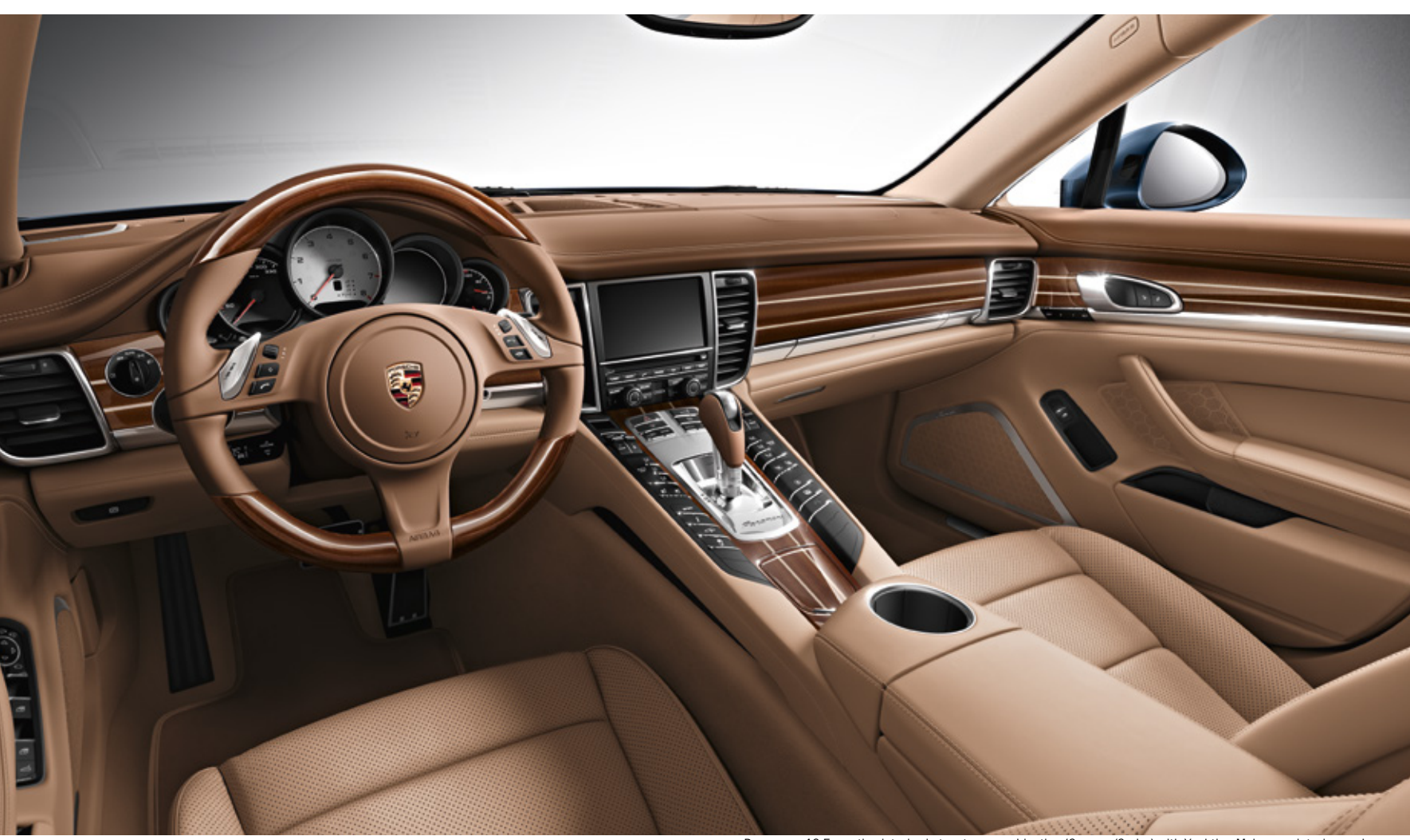
Panamera 4S Executive interior in two-tone combination (Cognac/Cedar) with Yachting Mahogany interior package