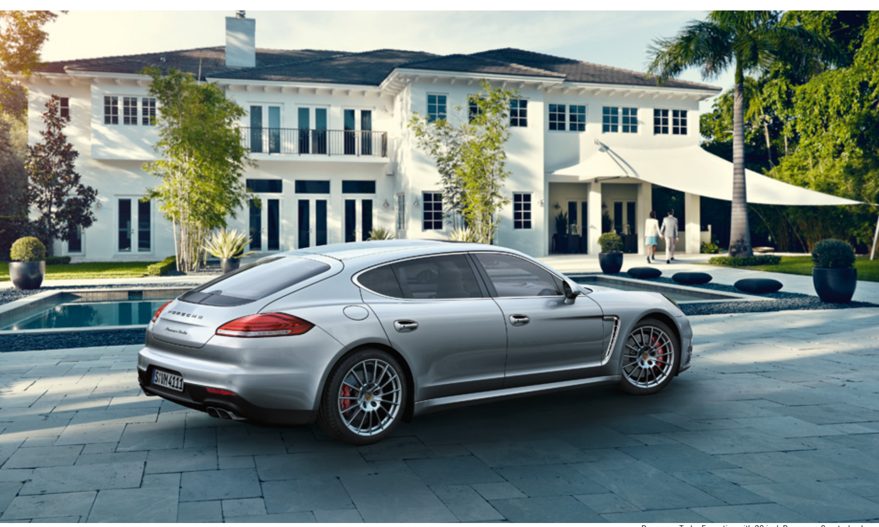
Panamera Turbo Executive with 20-inch Panamera Sport wheels