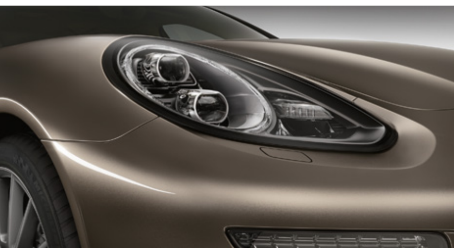
LED headlights in black including Porsche Dynamic Light System Plus (PDLS Plus)