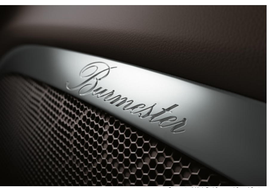
Burmester® High-End Surround Sound System

The Panamera Executive models follow a clear principle: lots of room for maneuver – and plenty of freedom to flourish. We don't want to stand in the way. On the contrary, we can suggest various ways in which you can put your own personal stamp on your Panamera Executive model.