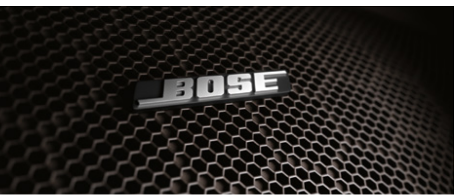
BOSE® Surround Sound System