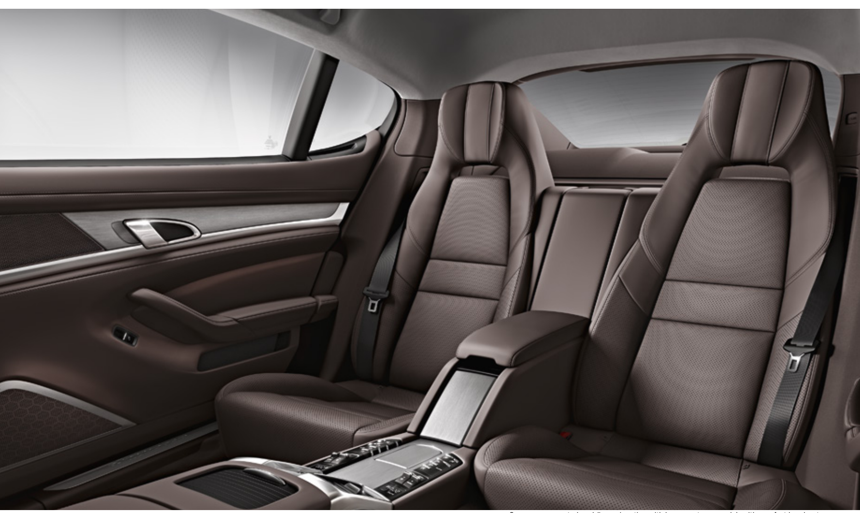
8-way power seats (rear) (in conjunction with large center console), with comfort headrests