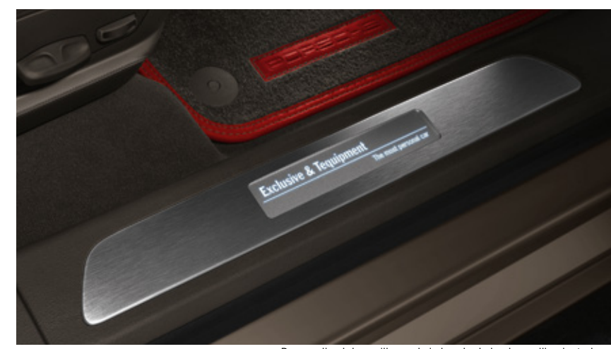
Personalized door sill guards in brushed aluminum, illuminated