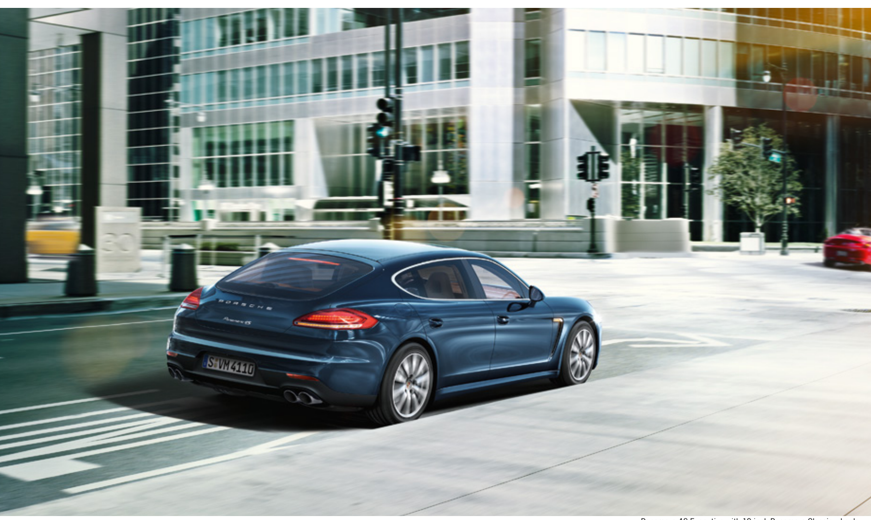
Panamera 4S Executive with 19-inch Panamera Classic wheels