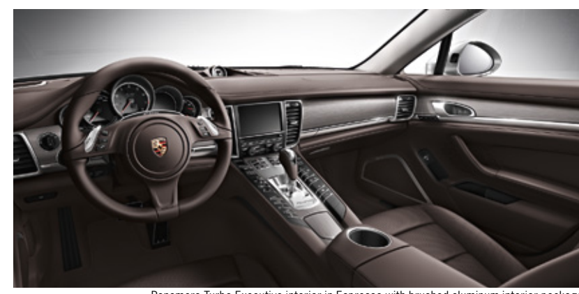
Panamera Turbo Executive interior in Espresso with brushed aluminum interior package

cockpit offers excellent ergonomics thanks to the logical grouping of all the controls. Just as you would expect from a Porsche.